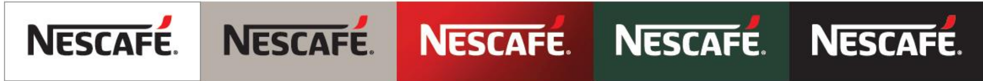
Examples of colour backgrounds