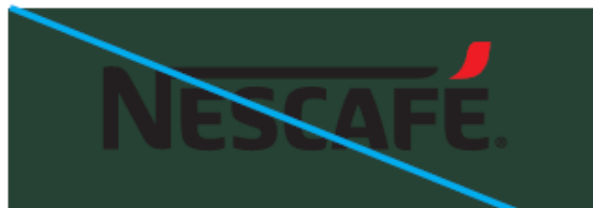
Do not use on a coloured background without sufficient contrast